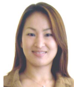
CALIFORNIA CPA #87381

Email any tax questions to: tenfourzeroinc@gmail.com